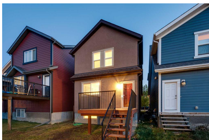
104 Masters Link SE, Calgary, AB